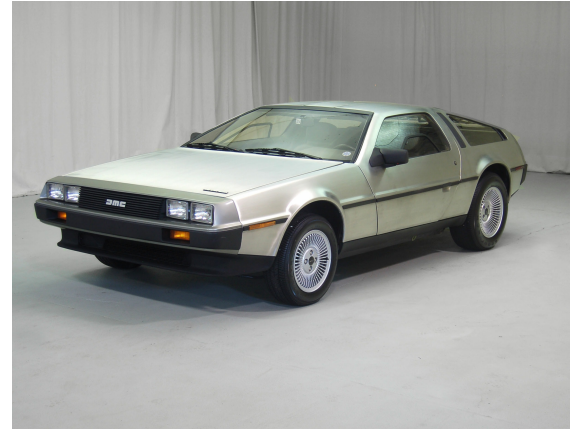
Image is general in nature and may not reflect the specific vehicle selected.

The public eagerly awaited the vehicle's 1981 launch, as the car had a rear-mounted engine set-up, gullwing doors, an angular form, and a novel stainless steel finish to accompany its who's-who pedigree. The car came fully loaded, with the only choice for the buyer being the color of the leather seats (gray or black) and the type of transmission (automatic or a 5-speed manual).